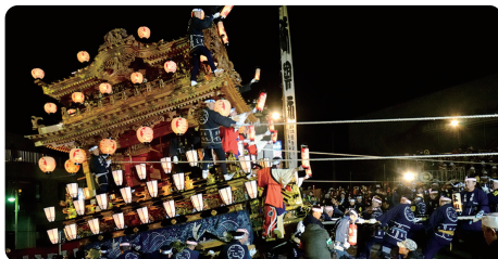
Pull up the slope "Dangozaka"