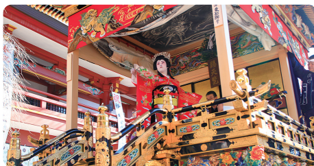
Dance in the floats